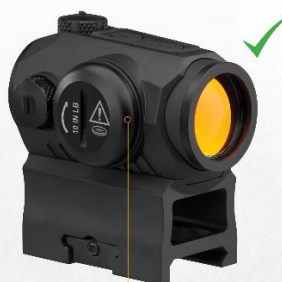
UPDATED COMPLIANT BATTERY CAP