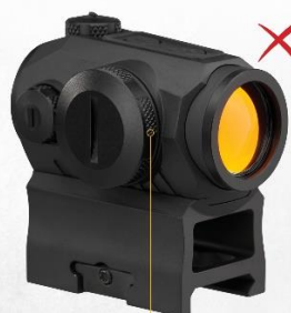
NON-COMPLIANT KNURLED BATTERY CAP