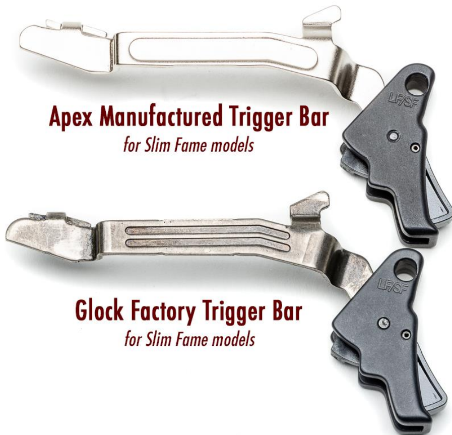
Apex Manufactured Trigger Bar for Slim Fame models

https://www.apextactical.com/sftb-recall